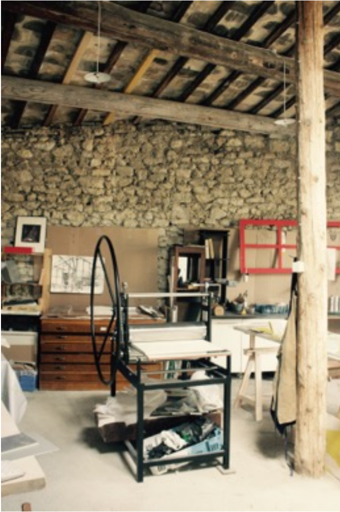
Print studio and Terrace studio